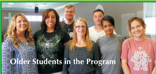
Older Students in the Program